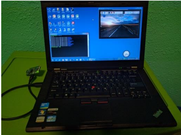
Illustration 3: Raspberry Pi Zero connected to a Windows 7 laptop with a single USB cable for power and communication. Shown with PuTTY and VNC sessions open.