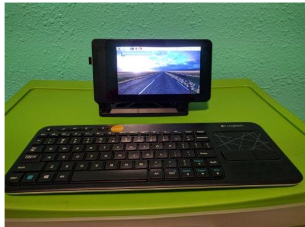
Illustration 1: Raspberry Pi 3 configured as a portable computer with a 7-inch touch screen and portable wireless keyboard.

short network patch cable between the Ethernet port of the Raspberry Pi and the Ethernet port on the laptop provides the necessary physical network connection between them. The Raspberry Pi board can be powered directly from a USB port on the laptop, so a short USB to MicroUSB cable can handle this function. A small amount of configuration on both the Raspberry Pi computer and the laptop is required to establish the network connection. Much of this configuration can be scripted or preprogrammed on the SD card image on the Raspberry Pi before the course starts.