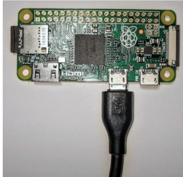
Illustration 2: Proper connection of microUSB cable when connecting to a laptop.

The Raspberry Pi Zero was configured to present itself to the host laptop as a combination of an Ethernet adapter, Serial Adapter, and USB Memory stick. By presenting itself as a USB Ethernet adapter for the laptop, the Raspberry Pi Zero can establish a TCP/IP based network between itself and the laptop just as a standard Raspberry Pi would when using an Ethernet patch cable. By presenting itself as a USB Serial port, the Raspberry Pi Zero can communicate with the host using a standard terminal program for text-only mode computing. By presenting itself as a USB Memory stick to the laptop, the Raspberry Pi Zero can store preconfigured programs and documentation that are usable on the host system to connect to the Raspberry Pi Zero itself. As a result, this approach presents all the benefits of the traditional Raspberry Pi approach using the laptop as a host, while reducing the time, skills, and extra equipment required for configuring the host laptop to connect to the Raspberry Pi.