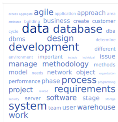
Figure 4: Tag cloud engine results (Student population 2: variable group)

The tag cloud output from student population 2, the variable group where instructor facilitation and intervention occurred during the week, is featured in Figure 4. Based on tag cloud properties, dominant themes are noted by the term data at the top level, the terms development , database , and system at the secondary level, and the terms requirements and process at a tertiary level. Additional levels of word data for this population are shown in Table 1.