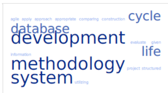
Figure 2: Tag cloud engine results (learning objectives)

Figure 2 features the tag cloud generated from the learning objectives captured as a text string. Based on tag cloud visual properties, dominant themes are defined by the terms system , development , and methodology at the top (most important) level, followed by the terms database , life , and cycle at a secondary level of emphasis. This output is noted in Table 1.