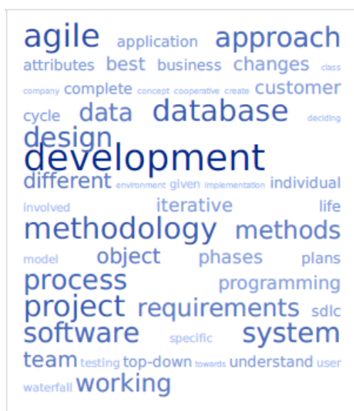
Figure 3: Tag cloud engine results (Student population 1: control group)

The tag cloud output from student population 1, the control group where no instructor facilitation or intervention occurred during the week, is featured in Figure 3. Based on tag cloud properties, dominant themes are noted by the term development at the top level, the term agile at the secondary level, and the terms database , methodology , and project at a tertiary level. Additional levels of word data for this population are shown in Table 1.