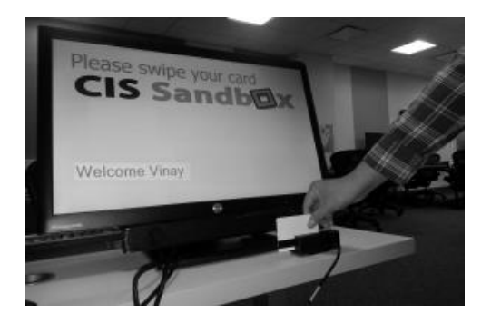
Figure 1. Swiping in at the CIS Sandbox.

gathers usage statistics about its users. When the CIS Sandbox opened in fall 2011, university support staff implemented, as a side project, a Visual Basic desktop application to record usage metrics. Students, upon entering the facility, swipe their ID cards using a magnetic card reader. The swipe application records the date and time of their arrival along with student's name and email address to an Access database. The application obtains the user's identity information by passing the ID number read from the ID card to a student directory database. The swipe application also displays a personalized welcome message to the student, confirming the scanner reads the student's card properly. Students view the acknowledgment, along with photos of tutors on duty, on a front-facing monitor as they enter (Figure 1).