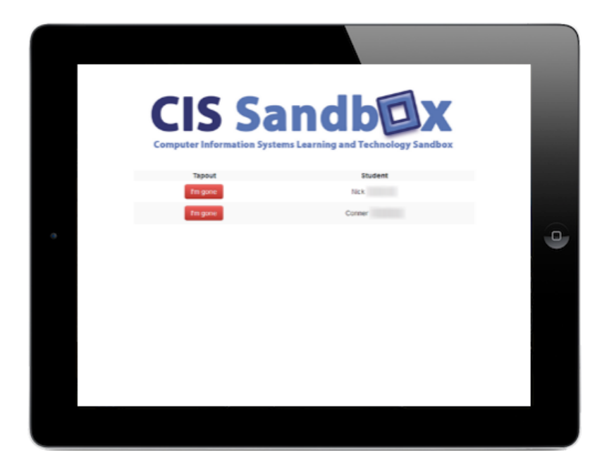
Figure 6. The Tap Out screen as displayed on an iPad mounted by the door.

Figure 5. The Tutor Form, populated with already-available information.