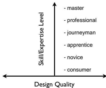
Figure 2. Design Quality's Relationship With Skill/Expertise Level

We propose two dimensions of design competency in order to explore design-centric IS pedagogy: 1) the breadth of design quality addressed and 2) the depth of skill/expertise in realizing these qualities in artifact design. The skill/expertise dimension represents an accumulation of knowledge, but also implies an aspect of “absorption” to indicate what might be a reasonable expectation for a particular “learner.”