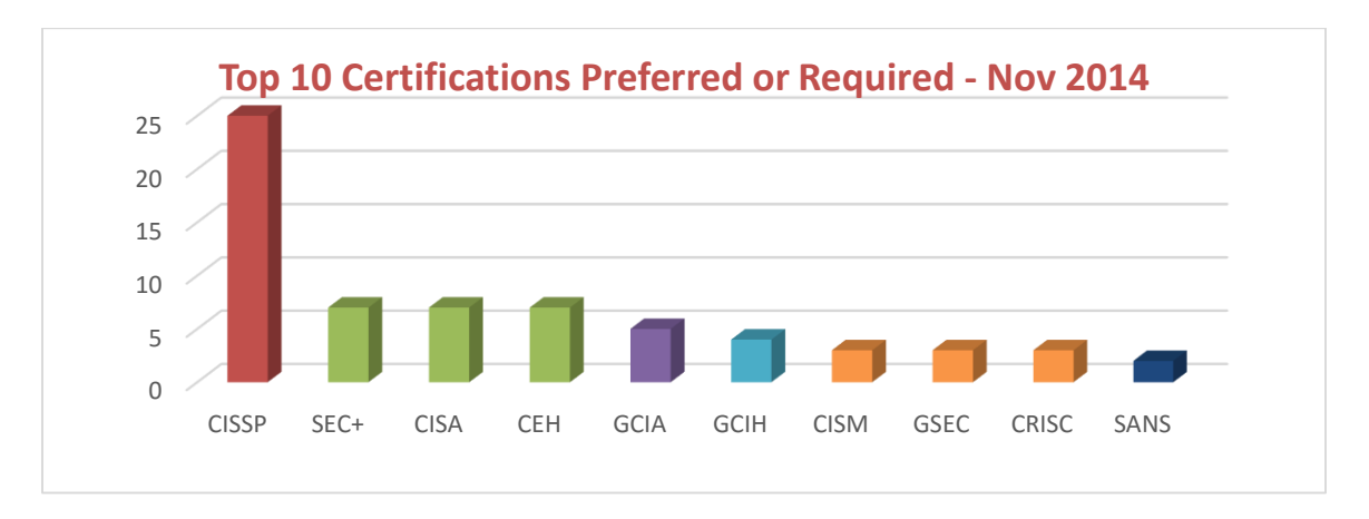
Figure 3 – Certifications preferred of required based on November 2014 Job Listings