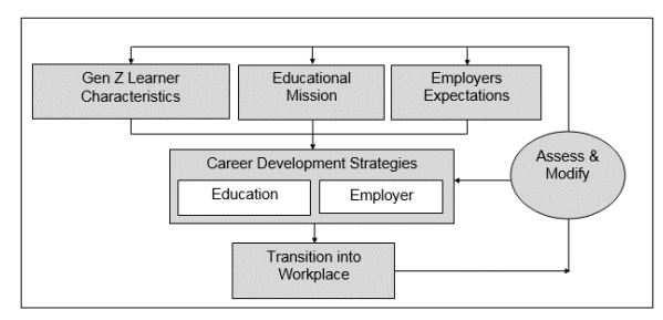
Figure 1 - Skills-based Infrastructure Model

characteristics and personality traits. process of educating the students, higher learning institutions can build upon and enhance those characteristics (processing) in order to prepare the program graduates to better meet the expectations sought by future employers (output). Figure 2 shows the correlation of the summarized characteristics at each phase of the IPO educational framework.