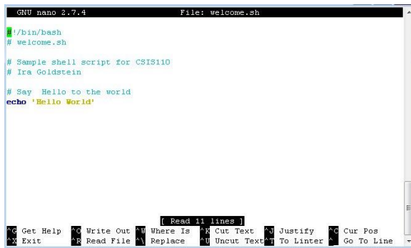
Figure 2 – Nano editor

The second lab began by having the students set up their own Raspberry Pis. Depending upon the number of upgrades issued since I created that semester's course's version of Raspbian, the students then patched their systems with the most recent update using the Advanced Packaging Tool apt-get . If the upgrade would take a significant amount of time, the students were instructed to perform the upgrade before the next lab. The flow of Lab two is summarized in Table 3. Objectives for this lab included having to describe the steps necessary to set up a Raspberry Pi, and to explain how arguments are passed to a shell script.